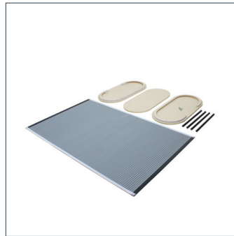
Wide Counter Collapsed