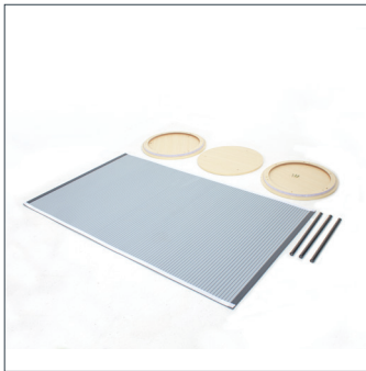
Small Counter Collapsed